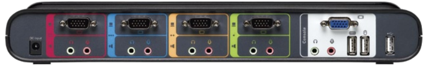
Model depicted above is F1DS104L.