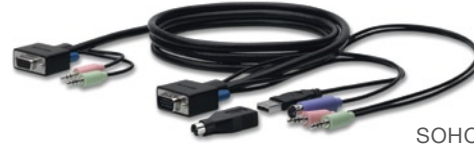
SOHO cable kits are included in the box