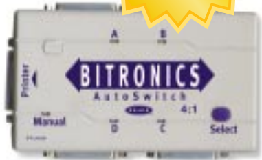
4 Port Bitronics AutoSwitch F1U124

See Page 81 for More Details on the Bitronics AutoSwitch!