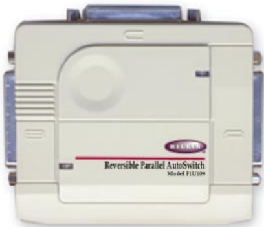
2 Port Reversible AutoSwitch F1U109

Belkin's Reversible AutoSwitches are capable of sharing one printer between 2, 3 or 4 PCs or can be used to connect one PC to 2, 3 or 4 printers. Includes easy-to-use Windows 95®/3.X and DOS software for printer selection. These models use straight through cables (Belkin Part #F3D111-06) to connect to PCs, and standard parallel printer cables on output (Belkin Part #F2A032-06).