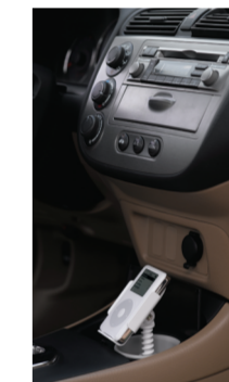
iPod not included 3-Year Warranty